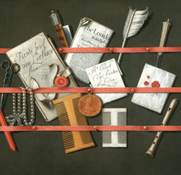
6 American Legion Northville 100 W Dunlap St Still Life: A Letter Rack , Edwart Collyer