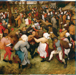
2 Lucy & the Wolf 102 E Main St The Wedding Dance , Pieter Bruegel