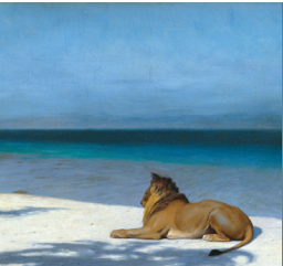
1 Northville Community Center 303 W Main St Solitude , Jean-Leon Gerome