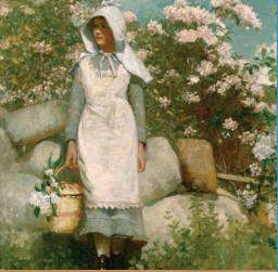
3 Mill Race Historical Village 215 Griswold St Girl and Laurel , Winslow Homer