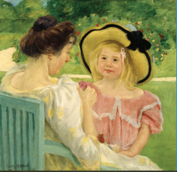
5 River Park Log Cabin Corner of River St. and 7 Mile In the Garden , Mary Cassatt